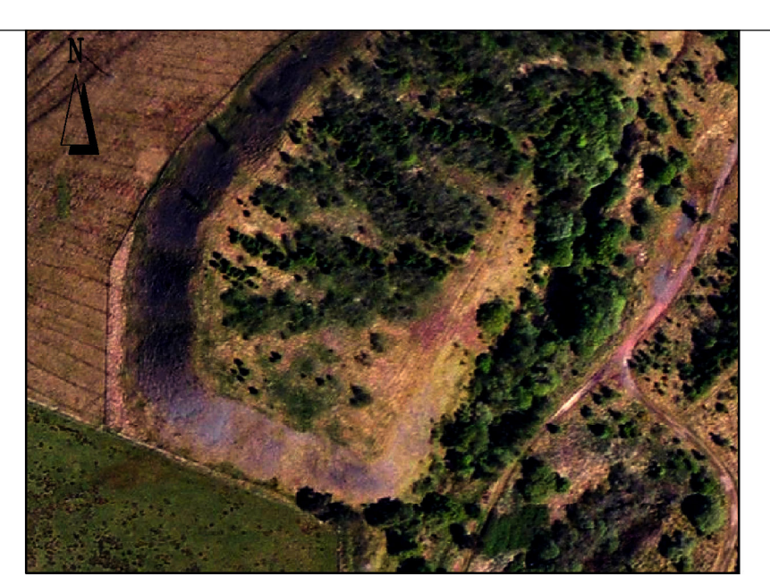
AERIAL VIEW OF EXISTING MOUND