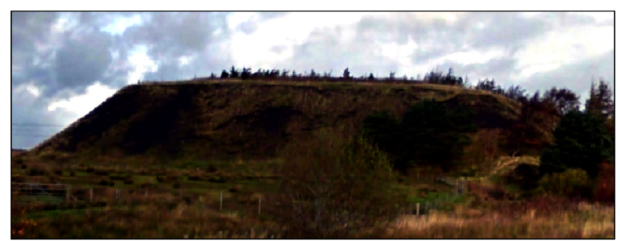
VIEW FROM SOUTH FACE OF MOUND (TO BE EXCAVATED)